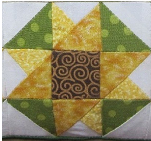
Close-up of Sunflower Block